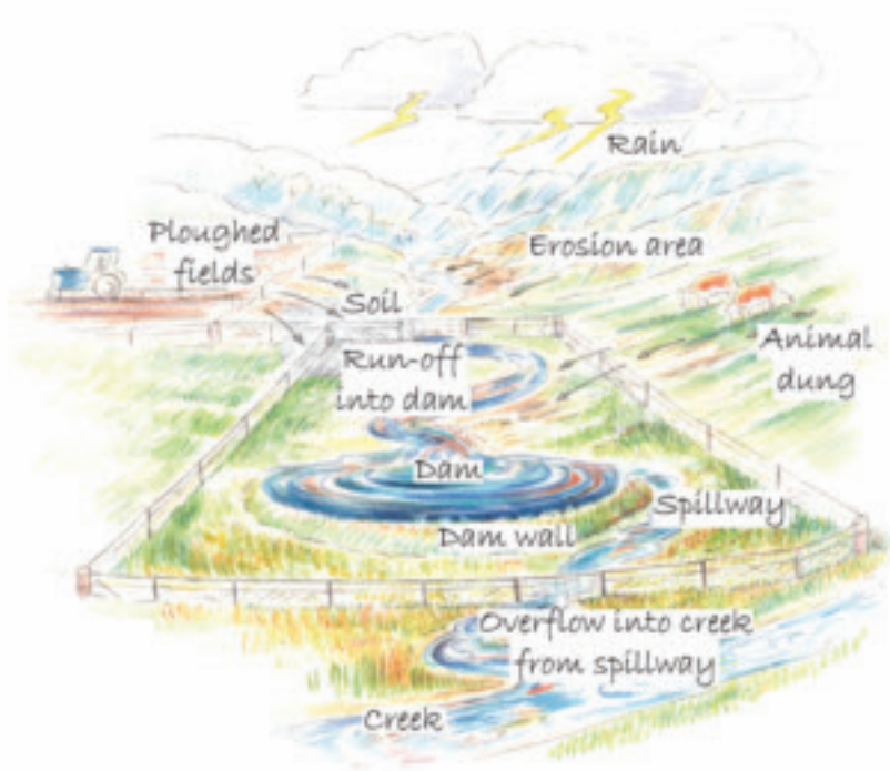
Figure 3 - How run-off enters the farm dam

The Department of Primary Industries can test your water quality to see if it is suitable and healthy for stock to drink (pH, chloride, turbidity and salinity).