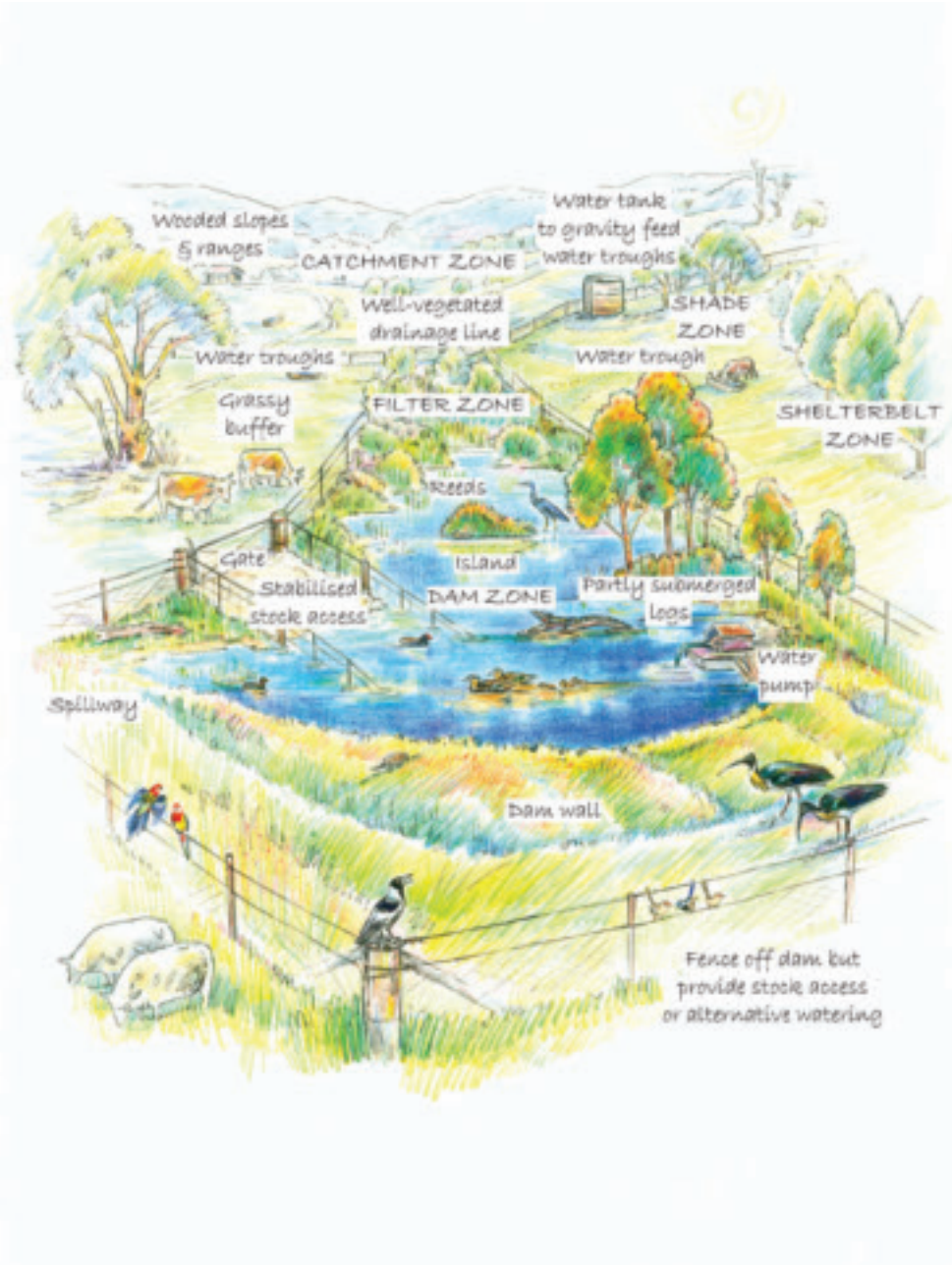
Figure 2 - The farm dam and its immediate surroundings